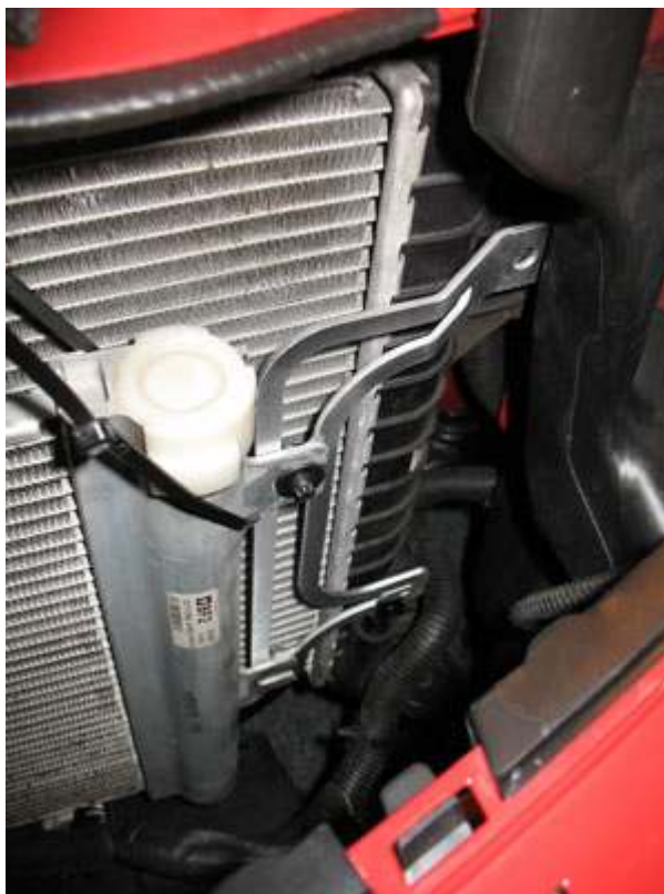
Location Bracket RHS (From Front) Showing pickup point onto radiator.