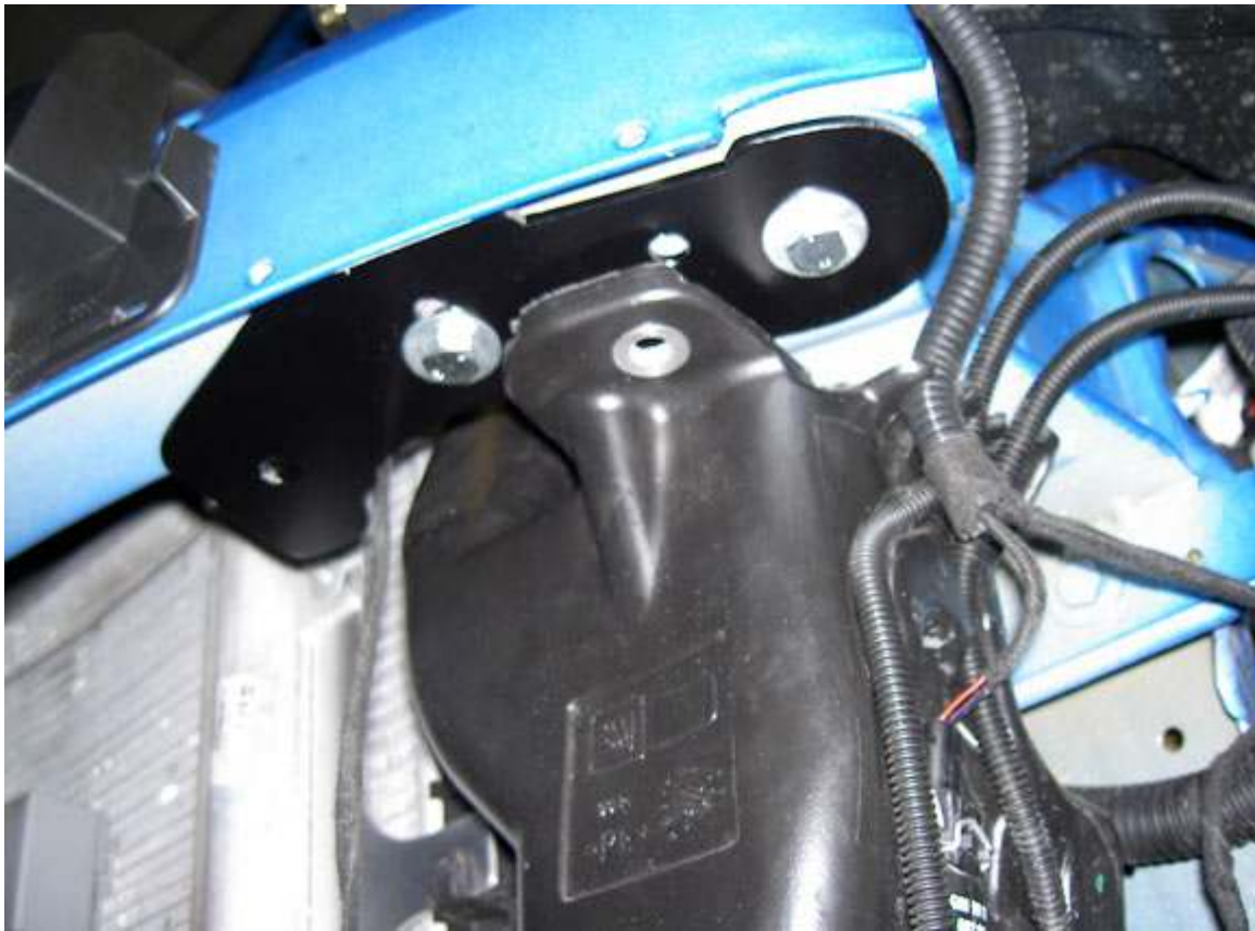
Locating Bracket. One Each Side. Note bolt orientation.

Courtenay Sport Ltd , Folgate Road, North Walsham, NR28 0AJ. England.