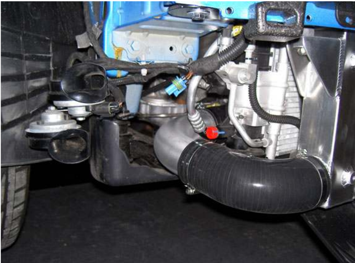
Inlet Side Hose Set Up (LHS From Front)