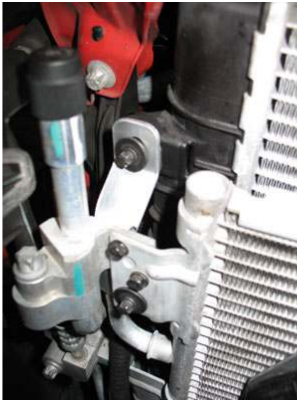
Location on LHS (From Front)

Courtenay Sport Ltd , Folgate Road, North Walsham, NR28 0AJ. England.