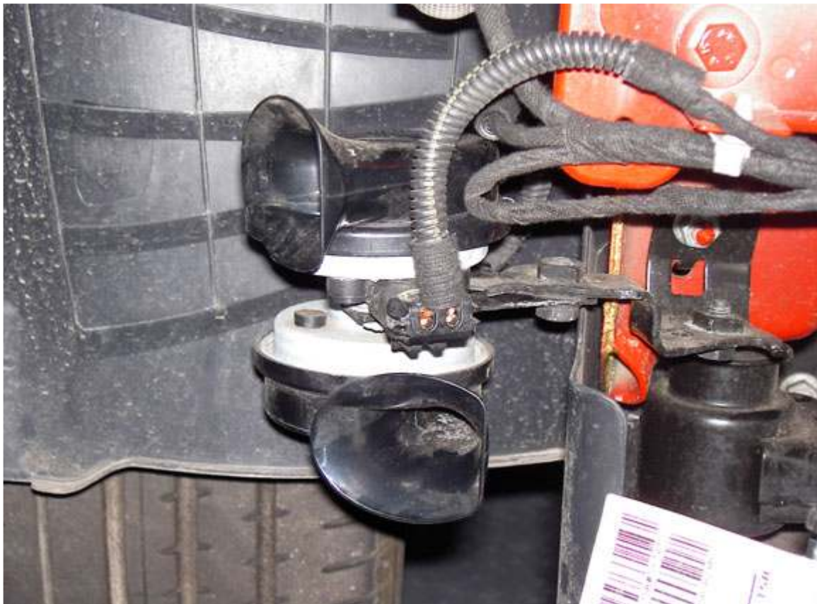
Horn Location – Turn Out of the way