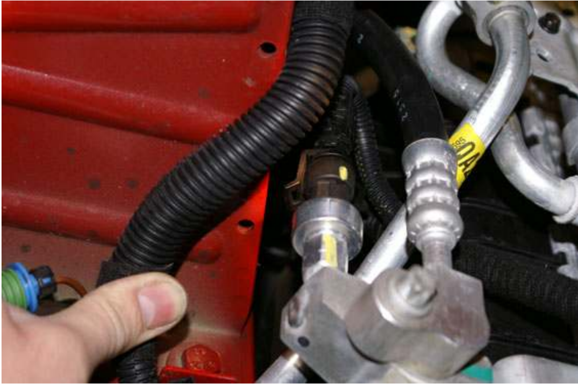
Aircon Valve Clearance – Check

Courtenay Sport Ltd , Folgate Road, North Walsham, NR28 0AJ. England.