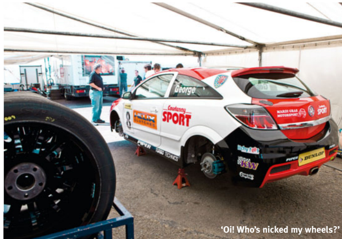
'Oi! Who's nicked my wheels?'

These small changes have seen significant improvements in the car as a whole; as Courtenay Sport MD Jon Shield says, 'The car is only at Stage 2 but it's so light it feels like a Stage 3. In fact it'll destroy a Stage 3 road car!'