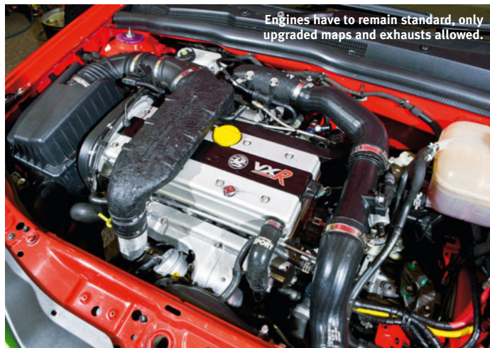
Engines have to remain standard, only upgraded maps and exhausts allowed.

This year's change of name also brought about changes in the regulations - the largest one being that race-spec slicks have replaced the road legal Dunlop Direzzas used last year. Despite these minor changes the championship is still designed to encourage mildly tuned, high-power 'showroom class' cars, keeping costs down and grid numbers high. Engines must remain standard apart from an exhaust and a custom remap, while bodywork, glass and fuel tank must stay exactly how the factory intended. Another advantage of retaining relatively standard engines is reliability - the ZzoLEH in Courtenay's car is in its third season and has never needed to be rebuilt. The only time the head has