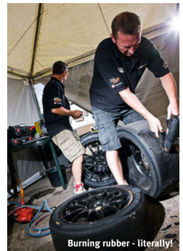
Burning rubber - literally!