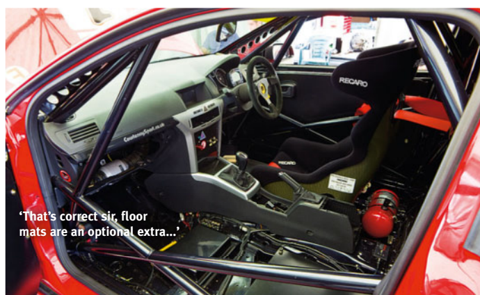
‘That’s correct sir, floor mats are an optional extra...’

been removed was to prove to the scrutineer that last year's championship winning car complied with the letter of the law.