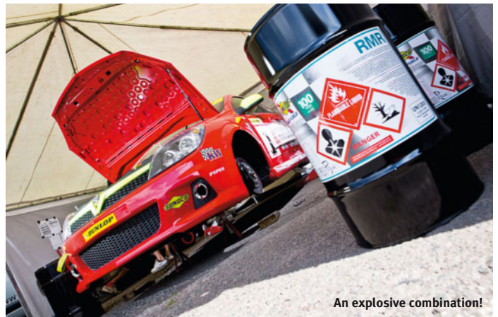
An explosive combination!