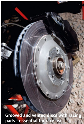
Grooved and vented discs with racing pads - essential for race use.