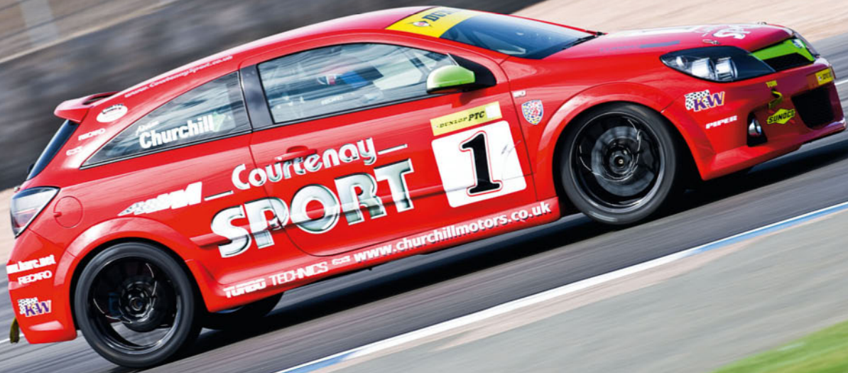
Giving it the beans through the bends.

'The slick tyres are making us 5-6 seconds a lap quicker!'