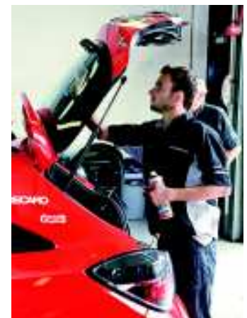
The Cupra R can't match the Astra's pace.