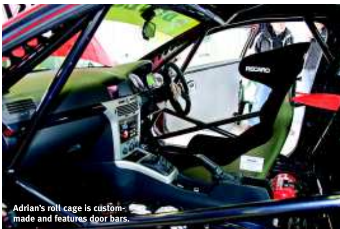
Adrian's roll cage is custom-made and features door bars.