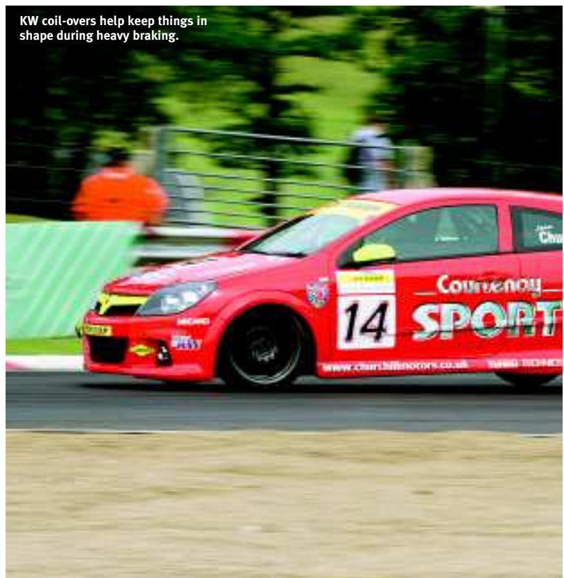
KW coil-overs help keep things in shape during heavy braking.