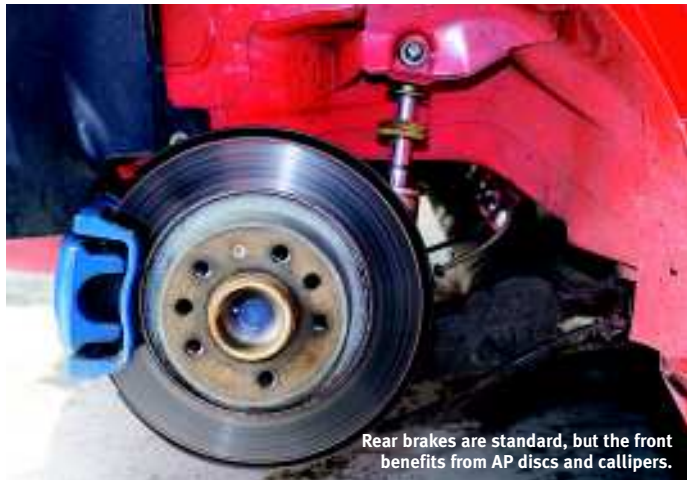
Rear brakes are standard, but the front benefits from AP discs and callipers.