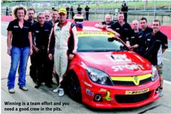
Winning is a team effort and you need a good crew in the pits.