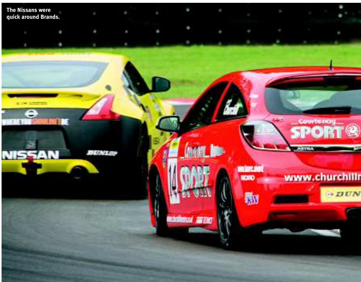
The Nissans were quick around Brands.